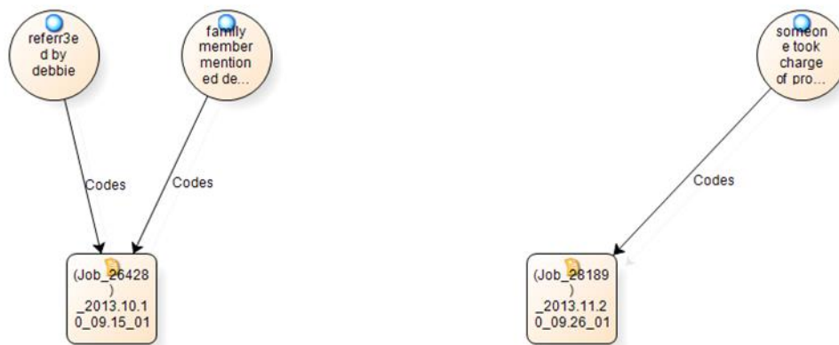
Figure 2 Conceptual model for no treatment group and support received