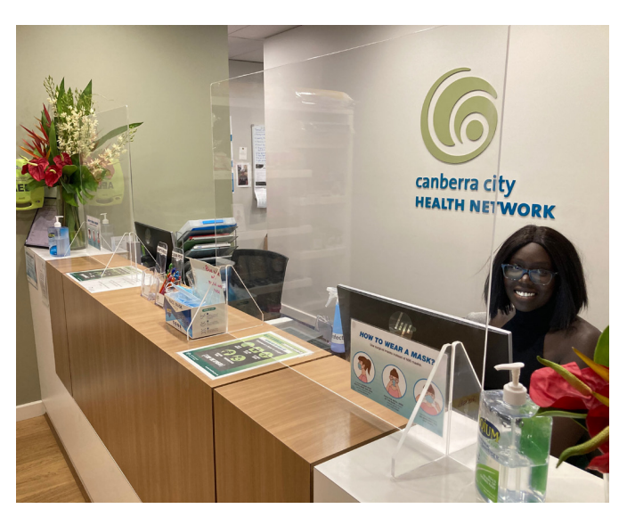
Image caption: CCHN made changes to strengthen infection control in the clinic. Sneeze guards were installed at the reception desk, and masks and hand sanitiser are available for patients upon entry. Educational COVID-19 resources are clearly displayed.

Interviews with practitioners and staff highlighted the important role that allied health primary care