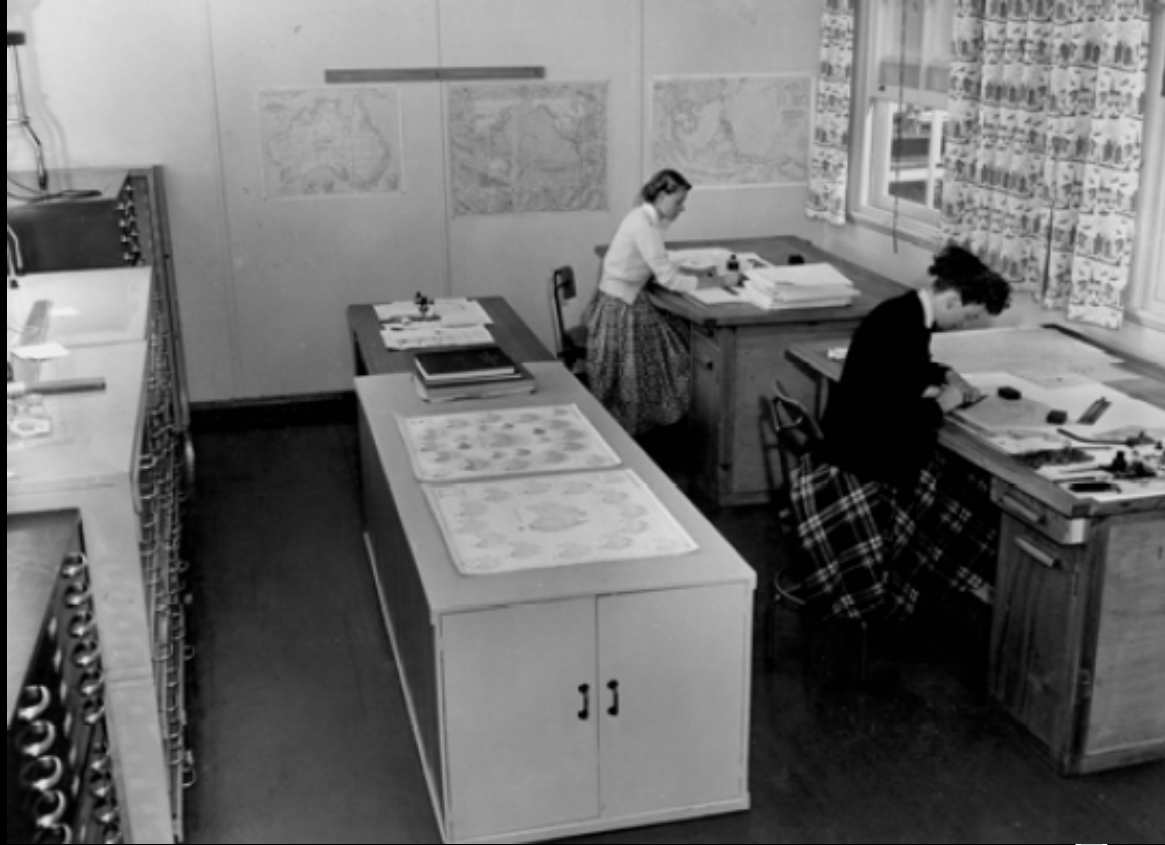
University Cartographic Room at the old Hospital Buildings, Late 1950s